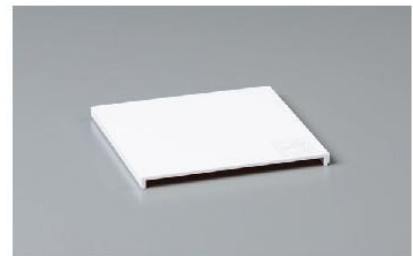
STORAGE LID ..... 149167 $5.00 AUD | $6.25 NZD

One white plastic topper. Topper fits on top of Ink Pad & Marker Storage Trays, Stampin' Blends Storage Trays and Open Storage Cubes. Holds up to 20 Stampin' Ink Refills or other small items. 5" x 5" x 1-1/4" (12.7 x 12.7 x 3.2 cm)