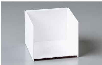
OPEN STORAGE CUBE 149171 $17.75 AUD | $21.00 NZD

Set of 5 white plastic trays. Each tray stores 6 Stampin' Blends markers. Stack several trays together or combine with other storage products. Peel-and-stick silicone feet are included to protect your surface and prevent slipping. Each tray: 5" x 5" x 7/8" (12.7 x 12.7 x 2.2 cm).