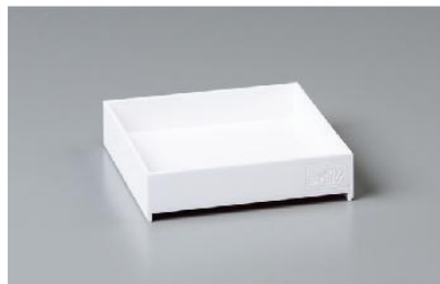
STORAGE TOPPER ..... 149170 $9.00 AUD | $10.50 NZD

One white plastic cube. The open-front design lets you neatly stash small items such as embellishments, adhesives, ribbon and more. Peel-and-stick silicone feet are included to protect your surface and prevent slipping. 5" x 5" x 4-1/16" (12.7 x 12.7 x 10.3 cm).