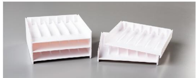
STAMPIN' BLENDS STORAGE TRAYS ..... 149169 $24.00 AUD | $29.00 NZD

Set of 5 white plastic trays. Each tray stores one Stampin' Pad and one Stampin' Write Marker (or Watercolor Pencil). Stack several trays together or combine with other storage products. Peel-and-stick silicone feet are included to protect your surface and prevent slipping. Each tray: 5" x 5" x 7/8" (12.7 x 12.7 x 2.2 cm).