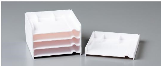
INK PAD & MARKER STORAGE TRAYS ..... 149168 $24.00 AUD | $29.00 NZD

Give your creativity some style and structure with Storage by Stampin' Up! With various shapes and sizes to choose from, it's up to you to organise your crafting space your way. See all the storage options below: